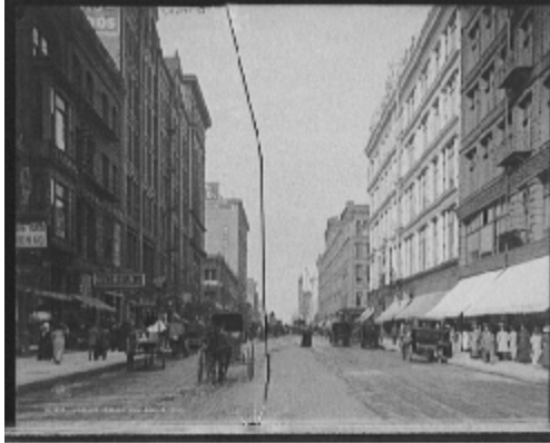
Nicollet Avenue, Minneapolis, Minnesota

Mr. Nicollet was extensively known throughout the United States, and his worth and kindness, as well as his singular talents and acquirements, were generally appreciated. The news of his death will excite general regret both at home and abroad. Of an ardent mind and delicate