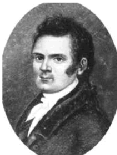
Indiana Historical Society