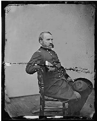
Gen. William H. Emory