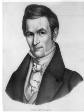
A lithograph of Cilley published after his death.

Jonathan Cilley was elected to Congress in 1836 as a supporter of Andrew Jackson. During his time as president, Jackson, a staunch Democrat, had shut down the Bank of the United States, slipping the country into a recession. Representative Cilley considered the coverage by a certain newspaper editor, James Webb,