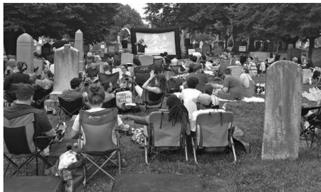
Visitors settle in among the tombstones for a screening of Galaxy Quest

We are all about dead-serious fun at Congressional Cemetery, and we decided to fill our summer nights with another returning program, Cinematery. This time, it was the “Summer of Space” at Congressional as we screened classic sci-fi summer films, including E.T. The Extraterrestrial , Galaxy Quest , The Hitchhiker’s Guide to the Galaxy , and Spaceballs . Our nighttime summer outdoor films delighted audiences with a mixture of laughs, thrills, and action. And while you would think a seating area in a cemetery would be full of a bunch of stiffs, the live reactions of the audience to the films were worth the price of admission alone. Cinematery will be back next year to haunt your summer evenings. We will save a seat for you!