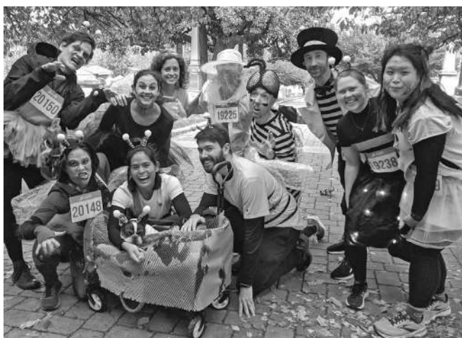
The “Zombees,” one of the contenders for best team costume at Dead Man’s Run

back in a big way. Over eight hundred runners registered for DMR5K in 2022, making it the largest and most successful run in the event's history! Thanks again to the efforts of our devoted volunteers and the professionalism of Pacers Running, the event was a no-sweat success. Hundreds of runners dressed up in costume for both the adult and child runs, including the winners of our individual and group costume contests. All the winners took home a coveted prize, the No-Bones-About-It Award of Excellence. We hope that you can join us next year for another invigorating Halloween fun run.