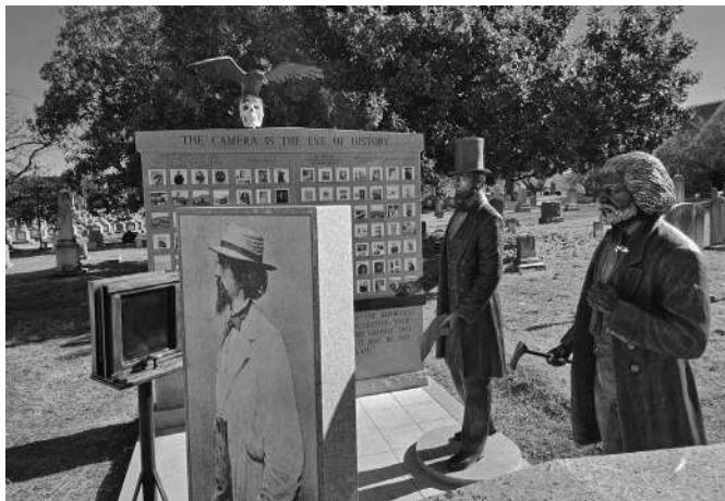
The Mathew Brady Memorial features statues of Abraham Lincoln and Frederick Douglass.

To top it off, we brought back Death Cafés, the hugely popular death positive get-together where individuals meet to drink tea, eat cake, and talk about death.