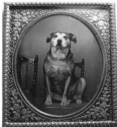
Man's best friend sitting nice and still for the camera in York, PA—a rare feat! This image was possibly taken by renowned African American daguerreotypist, G.J. Goodridge.

As guardian of these images for decades, West wished for his images to be studied by a wide audience of researchers and storytellers determined to dig out those stories of American history that have yet to be told. His images serve not only as pioneering new resources for historians and researchers but also as a clear illustration of their time period for future generations of museumgoers. Thus, West selected the Smithsonian Museum of American Art with its collections of millions of photographs and international reputation for storytelling across cultures to house his collection. Exhibitions of West's collection will start in mid-2023.