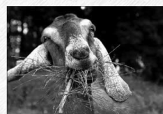
(Weird Al 2009- )