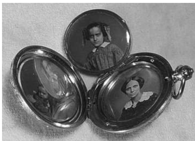
This watch locket is an example of some of the fine African-American photographic jewelry in the collection.

West has gathered photographic jewelry, plus the work of early African American photographers and images related to the Underground Railroad. His specialty lies in the earliest photographers themselves – including the largest US collection of three Black image makers and their daguerreotypes as well as the largest collection of African American photographic jewelry from 1850 to 1925. The treatise he compiled on the collection will be available for authors and fellow researchers in the new L.J. West Library in DC.