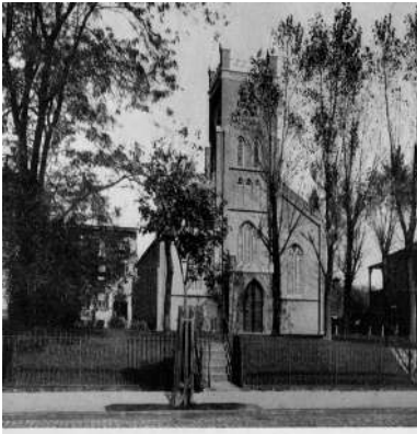
Christ Church, 1913