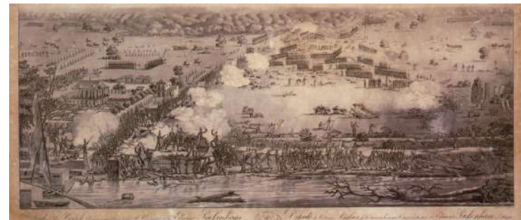
Battle of New Orleans, "drawn on the field of battle and painted by [Hyacinthe] Laclotte archt. and assist. Engineer in the Louisiana Army, 1815"