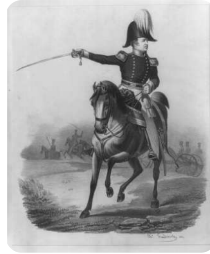
Library of Congress 2012645383