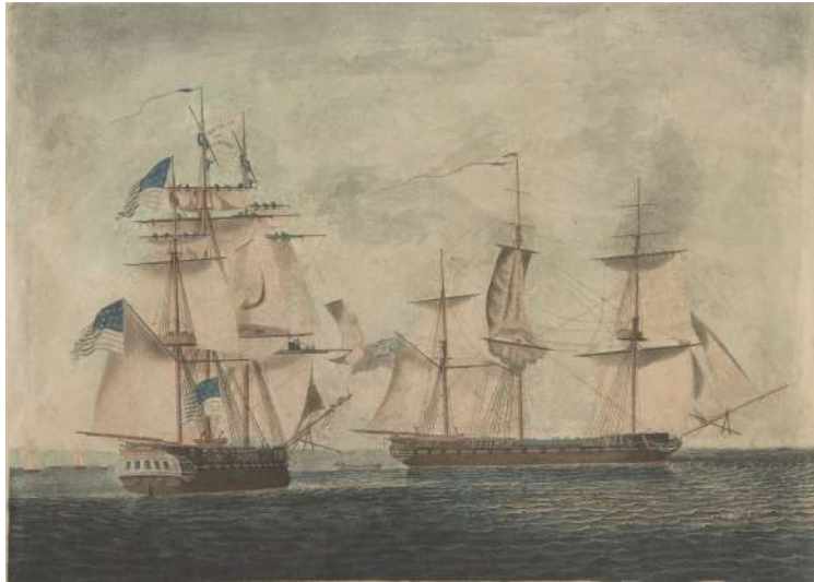
Artist: Robert Dodd, Library of Congress 98519184