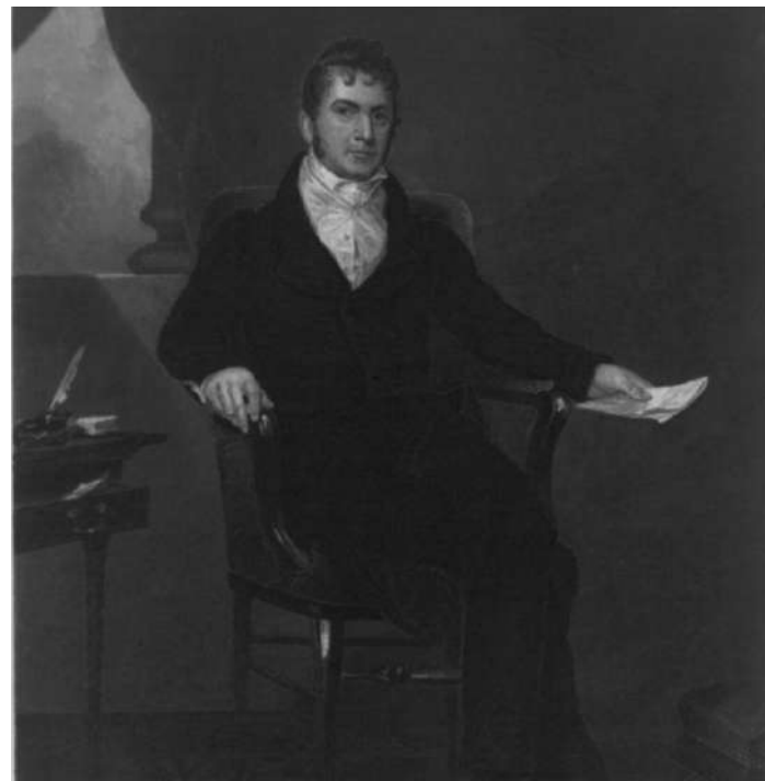
Chappel-Johnson, Fry & Co. Publishers, c1863 Library of Congress LC-USZ62-94115