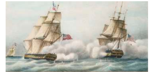
Engraving depicting Battle of August 23, 1812 between the frigates USS President and HMS Belvidera