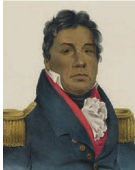
Push-Ma-Ta-Ha (1824), National Portrait Gallery

5. PUSH-MA-TA-HA (c. 1764–1824) led the Choctaw Nation during the War of 1812, fighting as an American ally. His warriors served alongside General Andrew Jackson at the Battle of New Orleans. A skilled fighter and experienced diplomat, he was widely respected by Americans, receiving an honorary appointment of Brigadier General in the U.S. Army. He traveled with a delegation of Choctaw leaders to Washington in 1824 to resolve disputes arising from settler claims to Choctaw lands. Shortly after his arrival, he died from contracting croup. His military funeral stretched a full mile, with thousands in the procession and others lining the way to his resting place. The guns from Capitol Hill thundered the tribute he had requested, "that the big guns be fired over me." R31/S41