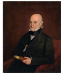
John Quincy Adams