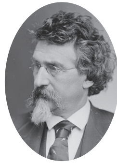
Mathew Brady

13. MATHEW BRADY (1822–1896) is known as the father of photojournalism. His daguerreotypes vividly recorded 19th century personalities and scenes of the Civil War. Brady and his team traveled to numerous Civil War battlefields, bringing images of war to the American public for the first time. The engraving of Abraham Lincoln on the five-dollar bill is made from his photographic portrait. Despite his prolific success, he struggled financially after the war when the federal government declined to buy his photographic plates. R72/S120