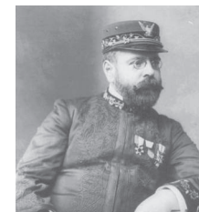
J.P. Sousa (1900), Library of Congress

Equal Rights Party. Even though women did not have voting rights, she received 4,000 votes. Widowed in 1853, she was determined to attend college and graduated at age 27. Despite her fine academic rating and ten years in the teaching profession, two law schools denied her applications for fear that a 40-year-old woman would "distract the other students." The vice chancellor gave her private instruction, but the faculty withheld her diploma until President Ulysses S. Grant intervened on her behalf. Barred from arguing before the Supreme Court based on "custom," she successfully drew up legislation to allow women to practice in that court. She practiced law for 43 years, passing away three years before women won the right to vote. R78/S296