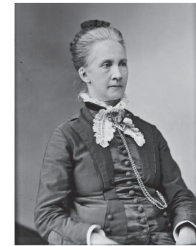
Belva Lockwood (c.1880), by Mathew Brady

10. BELVA LOCKWOOD (1830–1917) was nominated for president of the United States in 1884 by the National