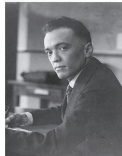
J. Edgar Hoover (1924)

6. J. EDGAR HOOVER (1895–1972) served as the first director of the Federal Bureau of Investigation. He lived his entire life in D.C., earning his law degree at George Washington University night school. He joined the Department of Justice in 1917 and rose to the Director's office at the age of 29. He reformed the FBI by removing political appointees and re-instituting legal and/or accounting backgrounds for agents. He professionalized federal crimefighting, establishing the first government operated forensics lab and instituting centralized databases. Hoover led the 1940s domestic security efforts against Nazi infiltration and against Communist