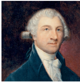
Dr. William Thornton, Architect of the Capitol

4. WILLIAM THORNTON (1761–1828) was a physician, but is better remembered for his architectural work. He won the competition for designing the U.S. Capitol in 1793. He also designed the Octagon House, Tudor Place, and Woodlawn. He received a gold medal for outlining a method of teaching the deaf to speak. His talents as a painter, novelist, and writer, coupled with his social graces and enthusiasm for horse racing, placed him in the center of Washington social life. R33/S39