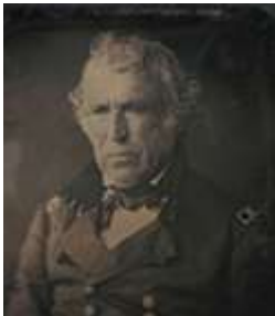
Zachary Taylor (c. 1849)