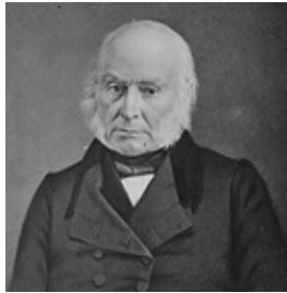
Hon. John Q. Adams (1847)

1. JOHN QUINCY ADAMS (1767–1848) was named minister to the Netherlands by George Washington in 1794 at age 26. He served as President James Madison’s minister to Russia before President James Monroe nominated him as secretary of state in 1817. JQA was the author of the administration’s eponymous foreign policy, the Monroe Doctrine. Adams successfully ran for president in 1824, a campaign in which no candidate received a majority of electoral votes. It marked the second time that a presidential election outcome was decided by the House of Representatives and the first time the victor lost the popular vote. He lost his re-election bid to Andrew Jackson in 1828. Adams was the only person elected to the House after their presidency, serving from 1831 to 1848. He died on February 23, 1848 from a stroke he suffered in the Capitol two days prior. His body was placed in the Public Vault on February 26th and removed March 6th. He received a cenotaph in his memory, as was customary for members of Congress who died in office until the 1870s. His widow, First Lady Louisa Adams, was temporarily interred in the Causten Vault in May 1852. R54/S101 (cenotaph)