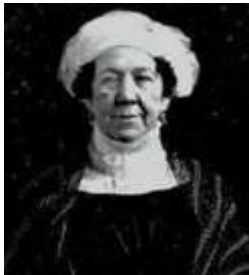
Dolley Madison (1848) by Mathew Brady, (LOC)

17. ANN G. SPRIGG (c. 1800–1870) ran a boarding house where Abraham Lincoln lived in the 1840s during his lone term in Congress. Years later, when Lincoln was president, he attempted to help Sprigg during her time of financial need by asking the Treasury secretary if he could find a job for her in the Department. R53/S41