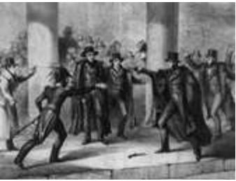
The Attempted Assassination of the President (1835)