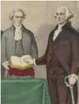
Inauguration of Washington (1876), by Currier & Ives

14. SAMUEL ALLYNE OTIS (1740–1814) was selected in April 1789 to serve as the inaugural secretary of the U.S. Senate. Later that month, it was Otis’s duty to hold the masonic Bible that was used in the ceremony at Federal Hall in New York City when George Washington took the oath of office as the first president under the Constitution. Otis was secretary of the Senate for a record 25 years and reportedly never missed a day of work in that span. R30/S14