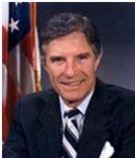
Robert A. Mosbacher

13. Robert A. Mosbacher (1927–2010) worked as the head fundraising operative for George H.W. Bush’s senatorial campaign in 1970. He filled the same role during Bush’s unsuccessful presidential bid in 1980 and his victory in 1988. Mosbacher then served as Bush’s secretary of commerce from 1989 to 1992 and played a substantive role in the creation of the North American Free Trade Agreement (NAFTA). R33/S19