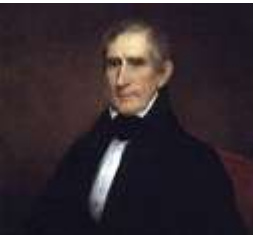
William Henry Harrison (1840), by Albert Gallatin Hoit, National Portrait Gallery (NPG)

This PRESIDENTIAL TOUR highlights just a few of the over 65,000 people buried in Congressional Cemetery. As you embark on this self-guided tour, we invite you to admire the artistry of the stone carvings, appreciate the beauty of the environment, and examine the diverse historical narratives and legacies of those interred here.