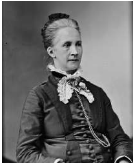
Belva Lockwood (c.1880)

11. BELVA LOCKWOOD (1830–1917) was nominated for president of the United States in 1884 and in 1888 by the National Equal Rights Party. She once declared, “I cannot vote, but I can be voted for.” She hoped her campaign would galvanize support for women’s suffrage. She became the first woman to be listed on a presidential ballot, achieving this in nine states in 1884. Though unable to arrange a debate between herself and major party candidates Grover Cleveland and James G. Blaine, Lockwood garnered 4,100 votes. R78/S296