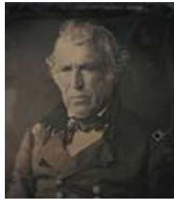
Zachary Taylor (c. 1849)