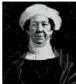
Dolley Madison (1848)