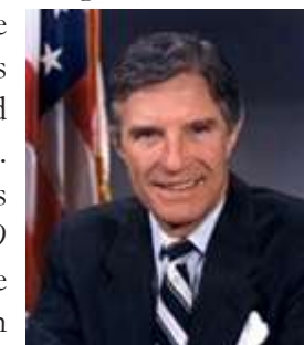
Robert A. Mosbacher

13. Robert A. Mosbacher (1927–2010) worked as the head fundraising operative for George H.W. Bush’s senatorial campaign in 1970. He filled the same role during Bush’s unsuccessful presidential bid in 1980 and his victory in 1988. Mosbacher then served as Bush’s secretary of commerce from 1989 to 1992 and played a substantive role in the creation of the North American Free Trade Agreement (NAFTA). R33/S19