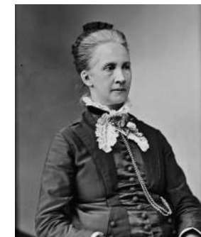
Belva Lockwood (c.1880)

11. BELVA LOCKWOOD (1830–1917) was nominated for president of the United States in 1884 and in 1888 by the National Equal Rights Party. She once declared, “I cannot vote, but I can be voted for.” She hoped her campaign would galvanize support for women’s suffrage. She became the first woman to be listed on a presidential ballot, achieving this in nine states in 1884. Though unable to arrange a debate between herself and major party candidates Grover Cleveland and James G. Blaine, Lockwood garnered 4,100 votes. R78/S296