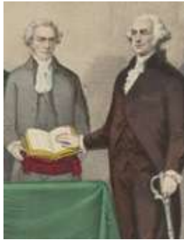
Inauguration of Washington (1876), by Currier & Ives

14. SAMUEL ALLYNE OTIS (1740–1814) was selected in April 1789 to serve as the inaugural secretary of the U.S. Senate. Later that month, it was Otis's duty to hold the masonic Bible that was used in the ceremony at Federal Hall in New York City when George Washington took the oath of office as the first president under the Constitution. Otis was secretary of the Senate for a record 25 years and reportedly never missed a day of work in that span. R30/S14