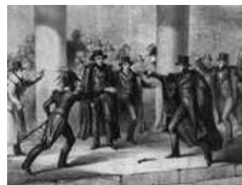
The Attempted Assassination of the President (1835)

6. CDR THOMAS R. GEDNEY (1799–1857) assisted in subduing Richard Lawrence, a house painter who attacked President Andrew Jackson on January 30, 1835. Gedney and Representative David Crockett lunged at and grabbed Lawrence after his pistols, aimed at the president, misfired. It was the first assassination attempt toward a sitting U.S.