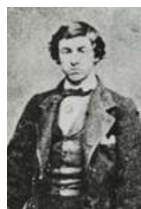
David Herold (1861)