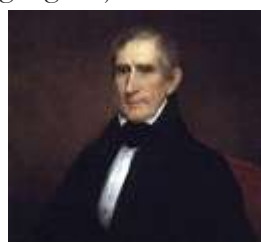
William Henry Harrison (1840), by Albert Gallatin Hoit, National Portrait Gallery (NPG)

This PRESIDENTIAL TOUR highlights just a few of the over 65,000 people buried in Congressional Cemetery. As you embark on this self-guided tour, we invite you to admire the artistry of the stone carvings, appreciate the beauty of the environment, and examine the diverse historical narratives and legacies of those interred here.