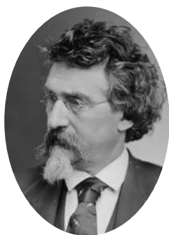
Mathew Brady

2. MATHEW BRADY (1822–1896) was one of the most accomplished photographers of the 19th century, whose pioneering work earned him the sobriquet, “The Father of Photojournalism.” His daguerreotypes, early photographs, vividly captured the likenesses of many famous personalities, including a remarkable 19 presidents -- all from John Quincy Adams to William McKinley, except William Henry Harrison. He notably took several photographs of Abraham Lincoln, including one that served as the basis for his portrait on the five dollar bill. Lincoln asserted that Brady’s work “made me President of the United States.” His other subjects included First Lady Dolley Madison and actor John Wilkes Booth, who subsequently assassinated Lincoln in 1865. R72/S120