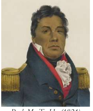
Push-Ma-Ta-Ha (1824) National Portrait Gallery

the promises Jackson had made to the Choctaw remained unfulfilled. In 1824, Push-mata-ha traveled to Washington seeking payment of debts owed by the Government to his nation. While here, he died of croup (and the debts were unpaid until 1888). His military funeral, led by then-Senator