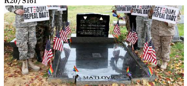
Gay veterans gather at grave before protests, November 2010