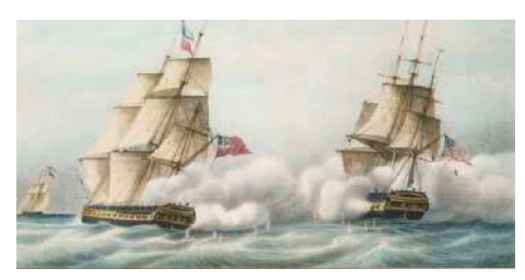
Engraving depicting Battle of August 23, 1812 between theyfrigates USS President and HMS Belvidera

He was the son of one of the most celebrated naval families in U.S. history. After spending 11 years in the merchant service, Rodgers entered the Navy as second lieutenant aboard the USS Constellation . His seamanship earned him promotion to captain and the command of several sailing ships during the Tripolean Wars, during which he extracted a treaty with Tripoli abolishing the payment of tribute and a similar agreement from the Bey of Tunis. During the War of 1812, he was the ranking active officer of the Navy and performed particularly well against British merchant shipping. He was senior officer of the Navy for many years, reaching Commodore and in 1823 he served for a short period as Secretary of the Navy. R56/S152