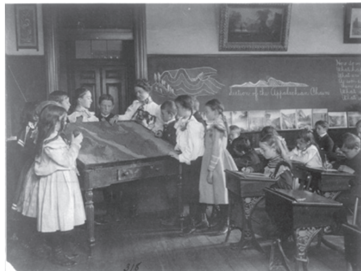
Geology class in a 6th Division Washington, DC public school, ca. 1899.

position and spent her free time listening to the debates in Congress and the Supreme Court, which fostered a fascination with law and lawmaking. She married again, to Ezekiel Lockwood, and acted on her ambition to be a lawyer. By then she was already an established leader and a spokeswoman for the DC suffrage movement, and a lobbyist for women’s equal employment. After years of adversity, Lockwood was finally presented with her diploma and admitted to the DC bar in 1873. The first woman licensed to practice law, she was an ardent lobbyist for women’s rights and frequently argued before Congressional committees against sex discrimination. Her law practice in her own name survived for 40 years, and she managed to earn respect for her legal