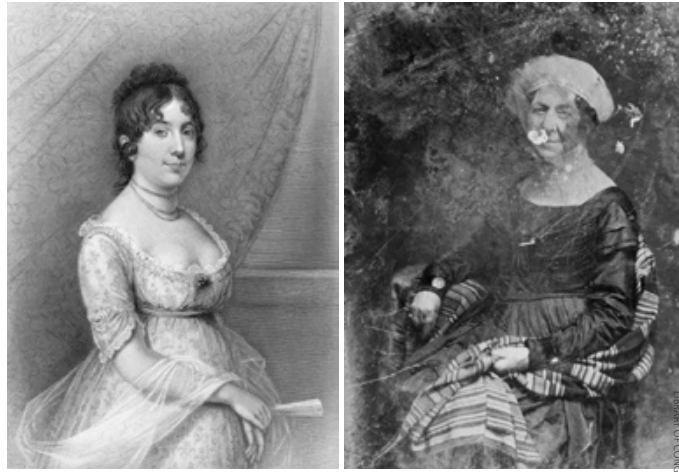
Portraits of Dolley Madison. The etching at left is from the painting by Gilbert Stuart. The daguerreotype is by Civil War photographer Mathew Brady, around 1848.