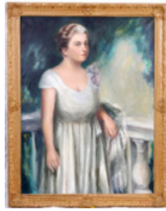
Awaiting usage approval