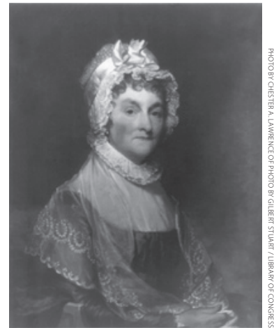
PHOTO BY CHESTER A. LAWRENCE OF PHOTO BY GILBERT STUART / LIBRARY OF CONGRESS