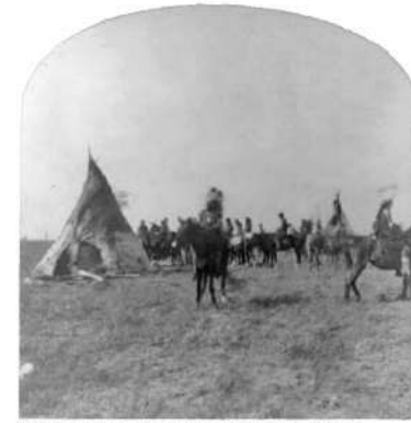
An 1866 stereograph of a camp of Pawnee Indians on the Platte Valley.

11. THOMAS FITZPATRICK (1798–1854), WESTERN SCOUT/INDIAN AGENT FOR THE UPPER ARKANSAS PLATTE INDIANS Fitzpatrick possessed more influence with the native denizens of the Great Plains than perhaps any other white man. As Indian agent in the remote West, he was one of the most active, faithful and competent men engaged in that arduous service.