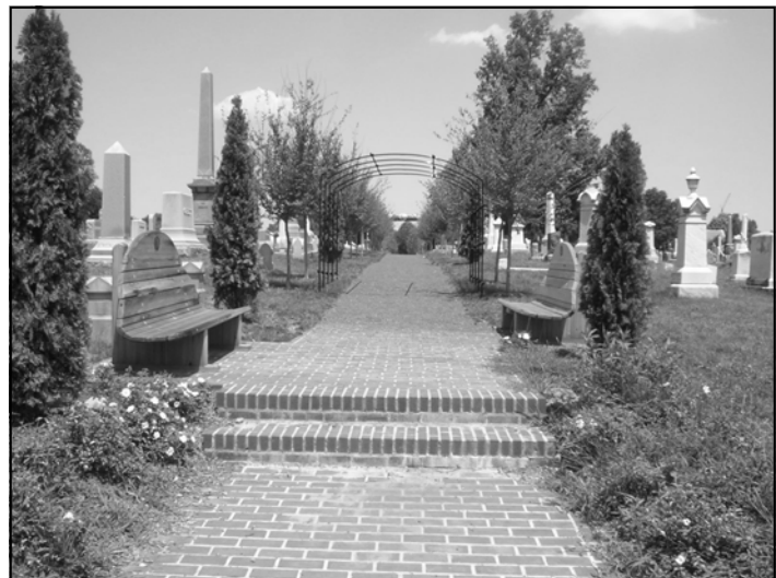
The Ward Six September 11th Memorial Grove at Historic Congressional Cemetery

Your continued support for the Association makes it possible for us to continue restoring and improving the grounds and historic markers.