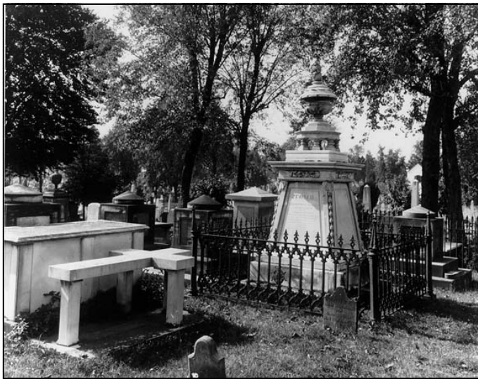
Elbridge Gerry Grave marker at Congressional

ble memorial for Gerry's gravesite nearly a decade after the Vice President's death.