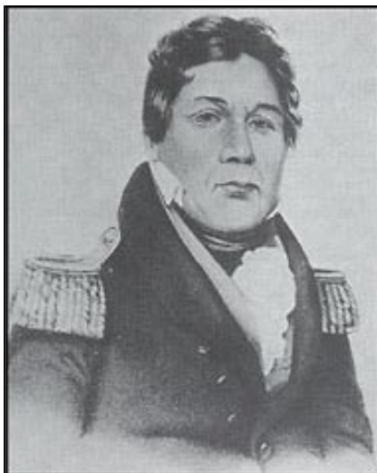
Push-Ma-Ta-Ha Photo by Charles Bird King Mississippi Dept Archives & History